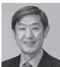
Shinichi Kitaoka Special Advisor to the President (Former President), Japan International Cooperation Agency (JICA)