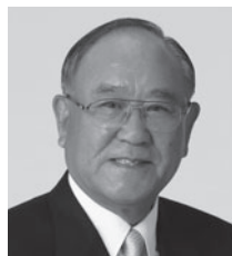
Fujio Mitarai Chairman & CEO / Canon Inc.