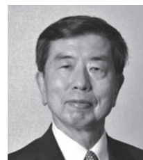
Takehiko Nakao Former President of the Asian Development Bank (ADB)